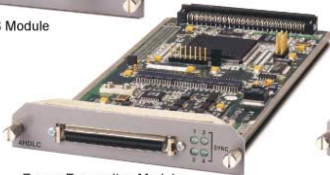
Frame Forwarding Module