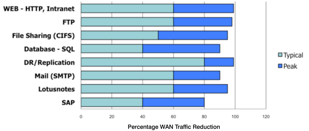
Figure 2 – Application response improvements achieved by reducing the amount of data on the WAN using compression, WAN memory and TCP acceleration.

Looking at the top bar in the chart above, we can see that HTTP traffic can typically be reduced by 60 percent using compression, WAN memory & TCP acceleration. A peak reduction of 98% can be achieved for environments with highly repetitive data or multiple concurrent flows of repetitive data.