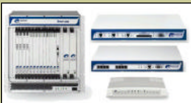
Tenor analog and digital VoIP Gateways