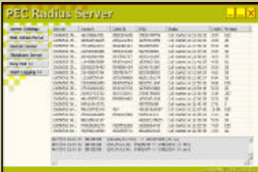
CardSaver VoIP prepaid Billing Software

How to become a Voice over IP service provider